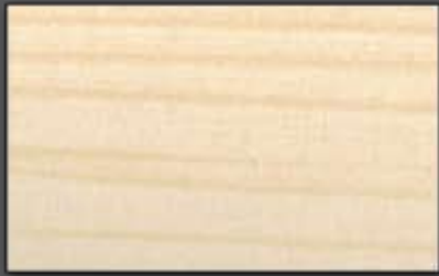
EW 6412 Light Maple