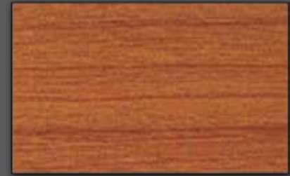
EW 6445 Wild Cherry