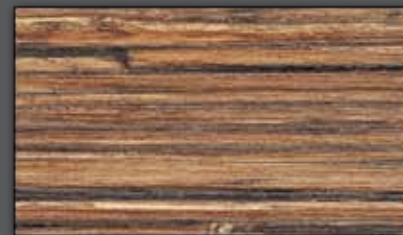
W 5122NT Seagrass