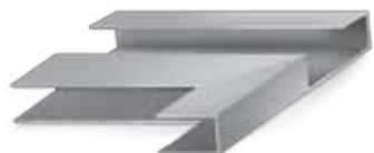
Aluminium Frame with Handle