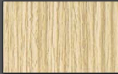
EW 6420 Legno Rovere