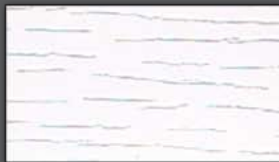
W 8101RW Corcovado