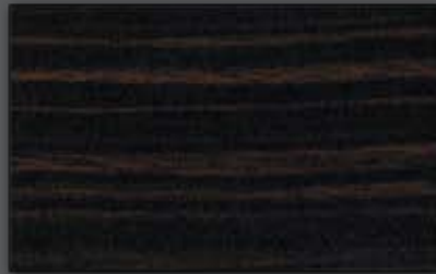
EW 5424 Rosy Ebony