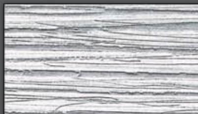
W 7114RT Vir Orfeo