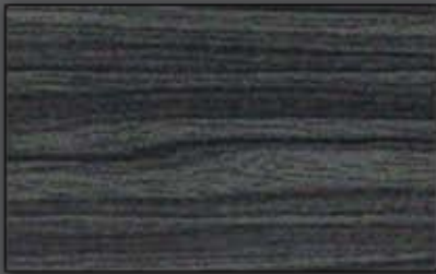
EW 9832 Equidae