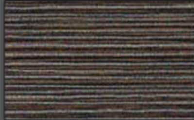
EW 6414 Clifton Wenga