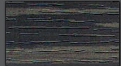
W 9120RW Murky Makassar