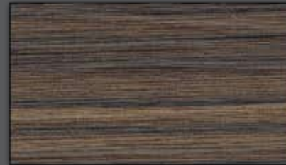
W 9115RT Macassar Coffee