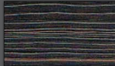
W 9118WT Witch Cherry