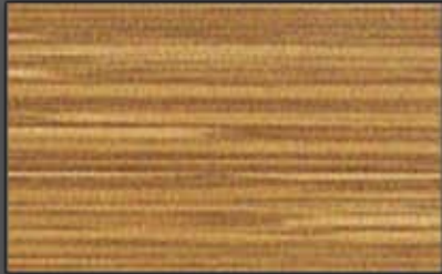
EW 6487 Rattan Cane