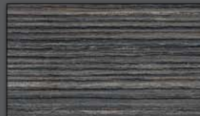
W 5133NT Season Seagrass