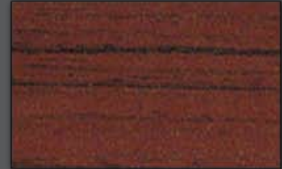
EW 9064 Mahogany