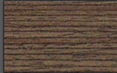
EW 6017 Piccolo Cane