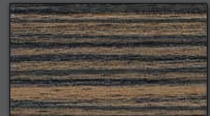
W 3112NT Safari Zebrano