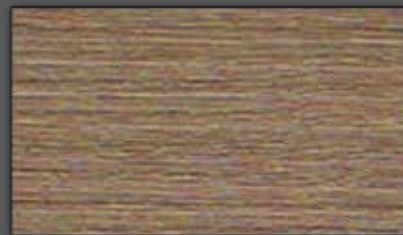
W 3189NT Delicasy Caster